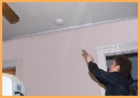
Figure 2: Point the remote toward the alarm.

or the channel button for 3 to 5 seconds (see Figure 2).