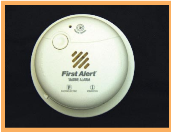
Figure 1: A smoke alarm for people with mobility impairments. This alarm comes with a 10-year battery and is tested and silenced by remote control.

You need at least one smoke alarm outside every sleeping area and on every level of your home. The most dangerous fires occur when you are sleeping. The smoke alarm should detect the smoke before it reaches your sleeping area and wake you up.