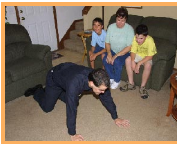
Figure 5: Practice crawling to get under smoke.

If the door does not feel hot, open it with caution. There still may be smoke and heat on the other side. If you open the door and find smoke or heat, close the door, and use your second way out. If the path to the outside is clear of smoke, or if you can crawl under the smoke, move quickly to the exit (see Figure 5).