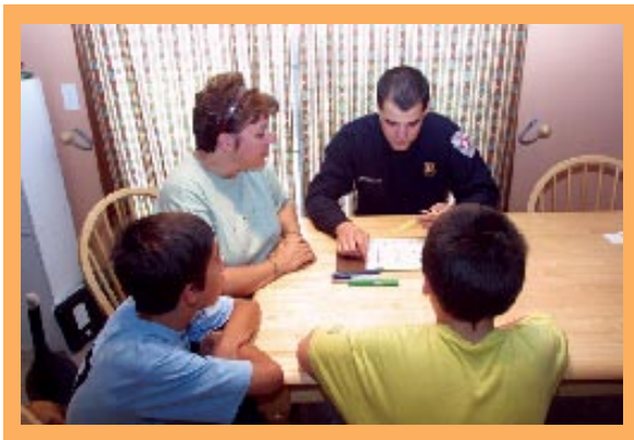
Figure 3: A family makes a home escape plan.

A home escape plan is your way out of your home if you have a fire. After you plan your escape, all family members should practice the escape plan every six months. The more you practice your escape plan, the more prepared you will be to take action in an emergency.